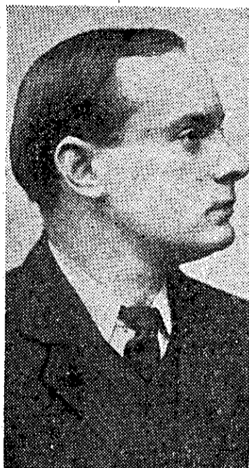
Patrick H. Pearse

The case was a gradual process. In the course of the proceedings, many points of law were raised by the counsel for the appellant.