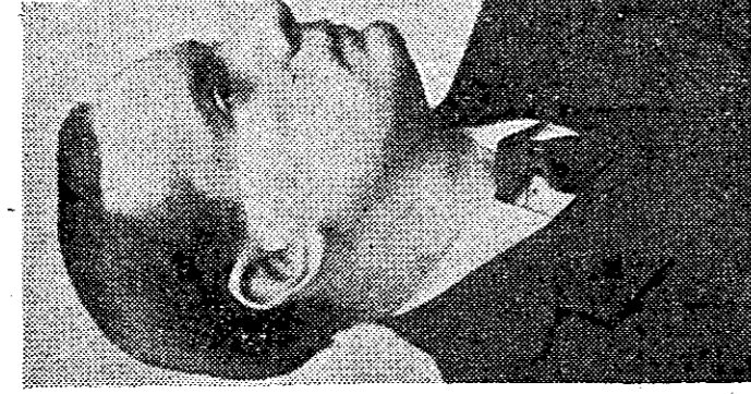
Patrick H. Pearse

It is quite certain, however, that when he was admitted to the Bar, judges of whom the chairman was